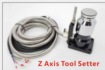
Z Axis Tool Setter