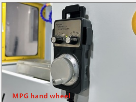
MPG hand wheel