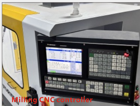
Milling CNC controller