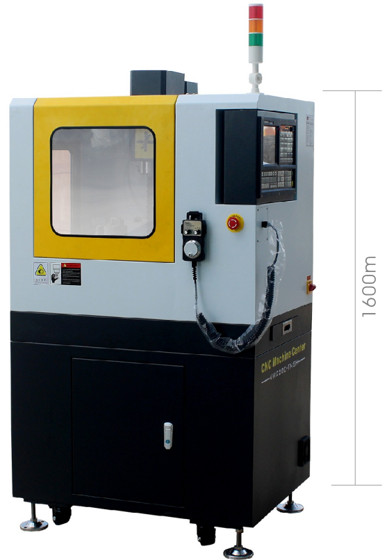
Optional Colour and Base

The VMC200 is a 3 axis small CNC machine center, available either floor standing or for bench mounting, with high performance 3 axis milling CNC controller, support multi language interface display, the standard spec includes MPG hand wheel. Selection of high -quality casting materials, High-precision linear guide and ballscrews, semi-automatic lubrication system, protect the rail life. 5 tools automatic tool change system (ATC), ISO20 spindle type, frequency conversion water cooling spindle motor, low noise, 24000rpm spindle supreme speed. Standard spec XYZ axis is stepper motor, option AC servo motor. with the option of flood coolant with industrial cabinet base and automatic aligning instrument. Ideal for cutting a range of resistant materials such as wax, plastic, acrylic, free cutting alloys, aluminium and steel. Recommended software programs (MasterCAM, UG, Fusion360, SolidWorks). Suitable for technology development, advertising design, art, ocational technical college Education & Training CNC and DIY enthusiasts.