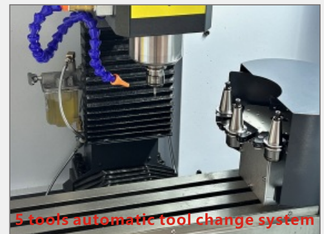
5 tools automatic tool change system