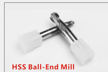
HSS Ball-End Mill