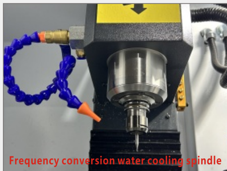
Frequency conversion water cooling spindle