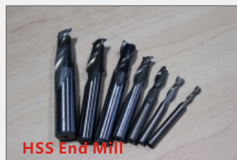
HSS End Mill