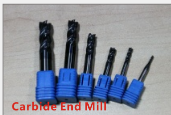
Carbide End Mill